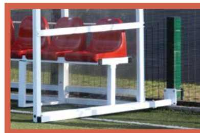
☒ 6m Shelter with Team Shelter Anchor