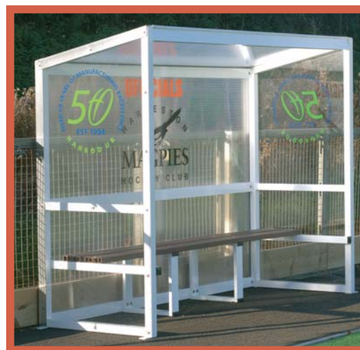
☒ 2.5m Aluminium Team Shelter

Please note: All team shelters are self assembly. Team Shelters must be anchored correctly at all times. The socketed option must have ground sockets concreted in as per instructions and freestanding versions should be fixed using suitable anchors such as spirafix. Please contact the sales office for further details.