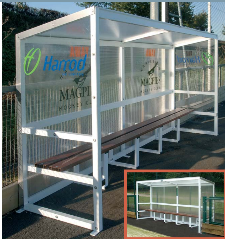
☒ 4m Aluminium Team Shelter