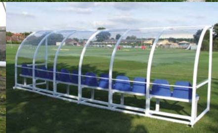
☒ 6m Shelter rear view