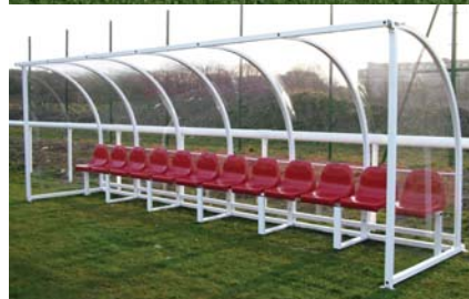
☒ 6m Shelter front view