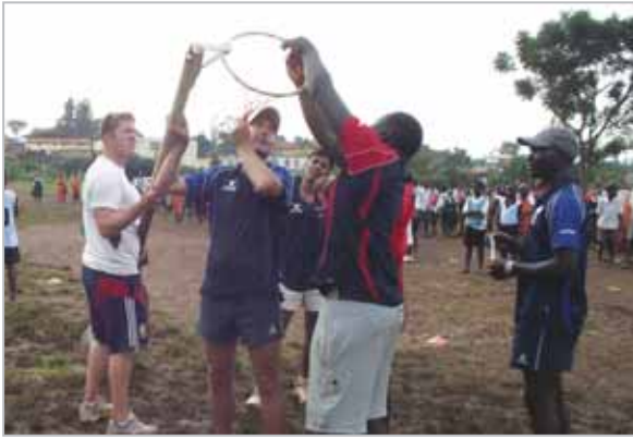
↑ Our netball nets were fitted to the existing posts