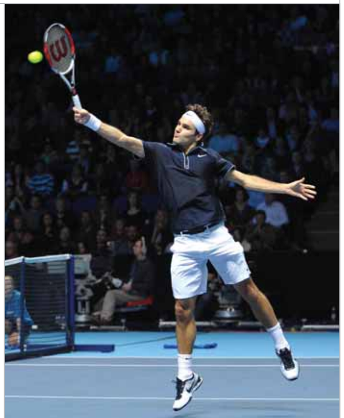
→ Roger Federer in action with our posts at the ATP finals

Our blue freestanding tennis posts took up their familiar position centre court, and so the stage was set for the top eight tennis players in the world to battle it out for the title of Champion. British hopes were high for Andy Murray as he reached the semi-finals but he was unable to beat Rafael Nadal, losing in three sets. This paved the way for a crowd-pleasing Nadal vs Roger Federer final showdown, which saw Federer walk away the victor with a 6-3, 3-6, 6-1 victory. The doubles title was scooped by Canadian-Serbian duo Daniel Nestor and Nenad Zimonjic.