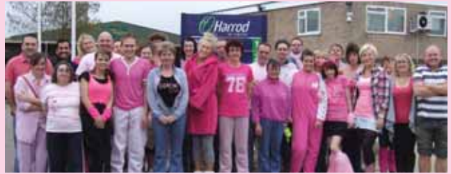
Everybody say.... Pink!