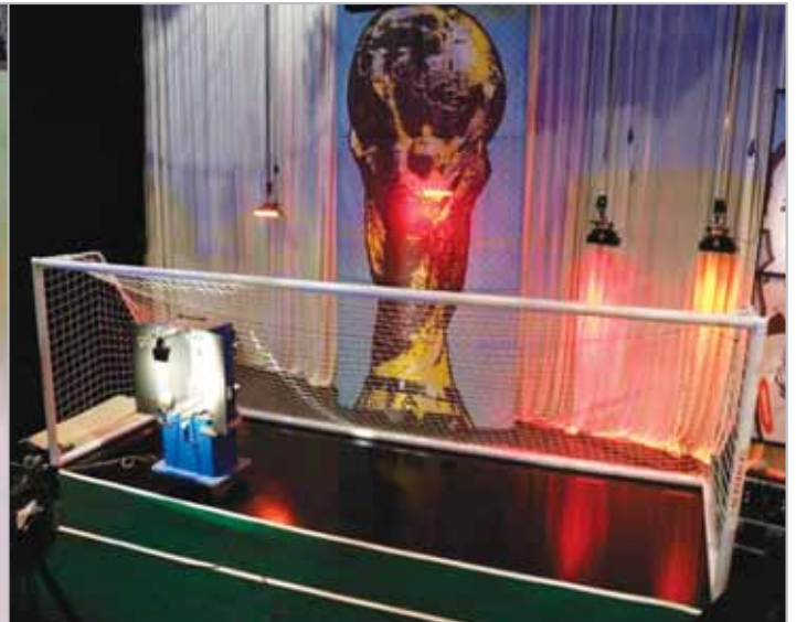
↑ On the set at "James Corden's World Live"